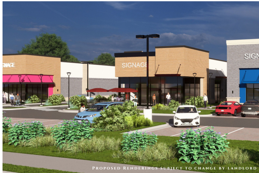
PROPOSED RENDERINGS SUBJECT TO CHANGE BY LANDLORD